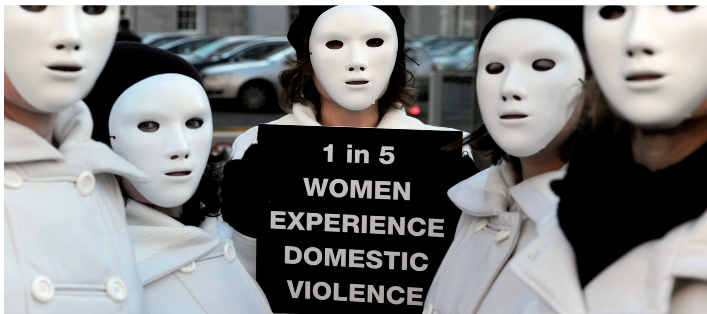
Women's Aid Campaign, Ireland

Domestic violence and poverty and social exclusion are highly gendered phenomena and must be interpreted within the broader social framework of gender inequality and traditional power relations between women and men. When addressing domestic violence against women, the links between women's marginalisation and male violence must be recognised and systematically addressed if we are to tackle the root causes of violence against women. Within this framework, the support system must not only provide women with adequate psychosocial support but aim to provide those opportunities that will help women regain control over their lives and live in dignity free from violence.