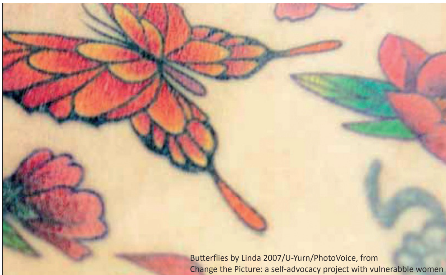
Butterflies by Linda 2007/U-Yurn/PhotoVoice, from Change the Picture: a self-advocacy project with vulnerable women