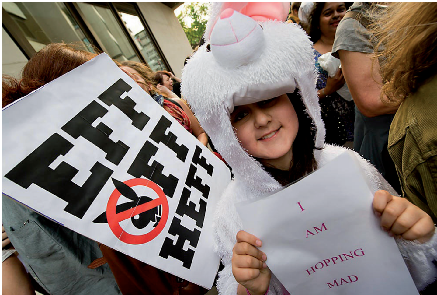
Hopping mad

What do supporters of the 'abstinence' or 'purity' movement (a fast growing campaign across Europe and the USA which is also linked to the so-called 'pro-life' campaign with a core aim to stop young people having sex unless they enter a heterosexual marriage) have in common with Hugh Hefner, head of the Playboy Empire? Neither can provide a template for decent, responsible sex education for the young people of today.