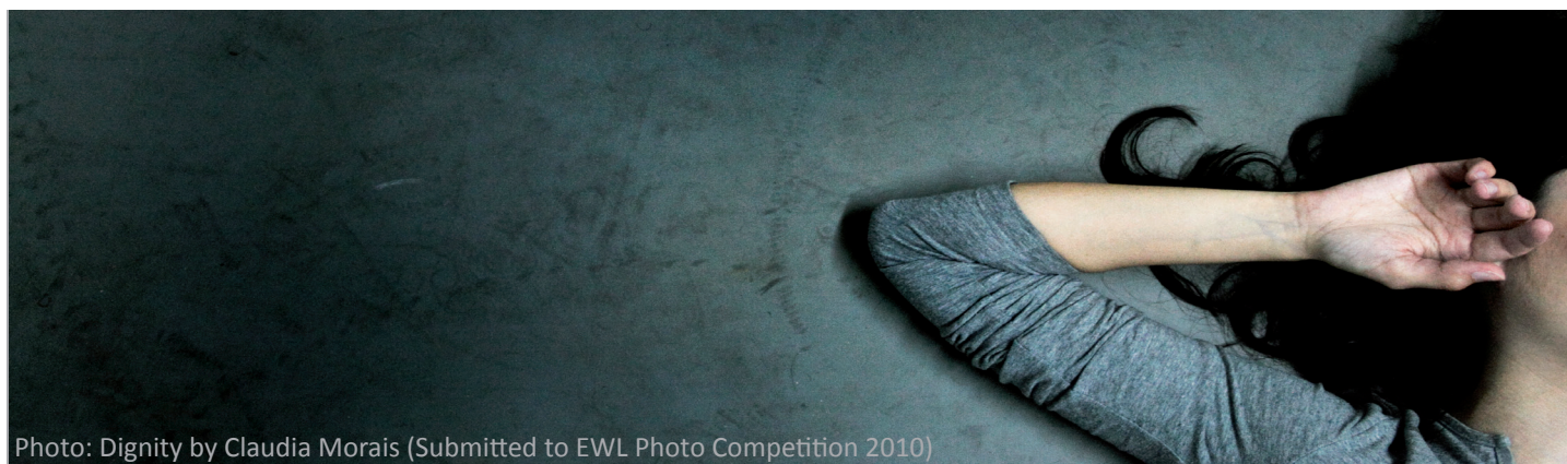
Photo: Dignity by Claudia Morais (Submitted to EWL Photo Competition 2010)