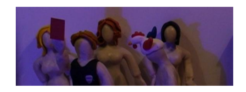
Clip 'Sport, Sex & Fun' (EWL, 2012)

Clip 'For a change of perspective' (EWL, 2011)